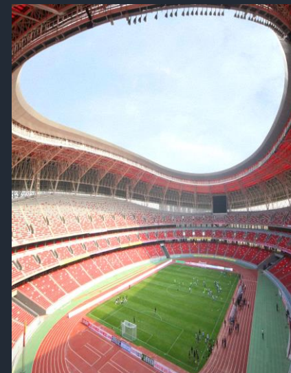
Big Sports Events