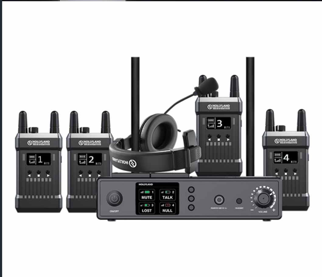
1000FT Full-Duplex Wireless Intercom System