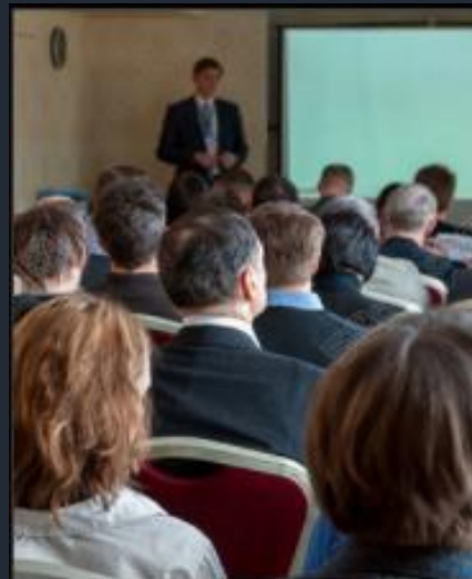
Education & Training